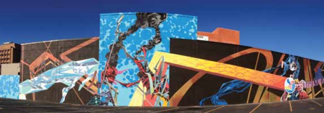
Aaron Noble. Quantum Bridge . © 2013

“For some quality culturevulturing, park along Albuquerque’s legendary main artery, Central Avenue, near Fifth Street, and start walking... and you’ll realize that this is one of the hippest places in the state to check out contemporary art.”